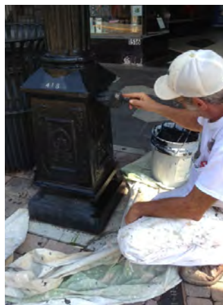
Ybor City's historic lampposts were updated this summer. The lampposts received energy efficient LED bulbs and a fresh coat of paint. Worn globes were replaced. The historic lampposts are an icon of the Ybor City Historic District.