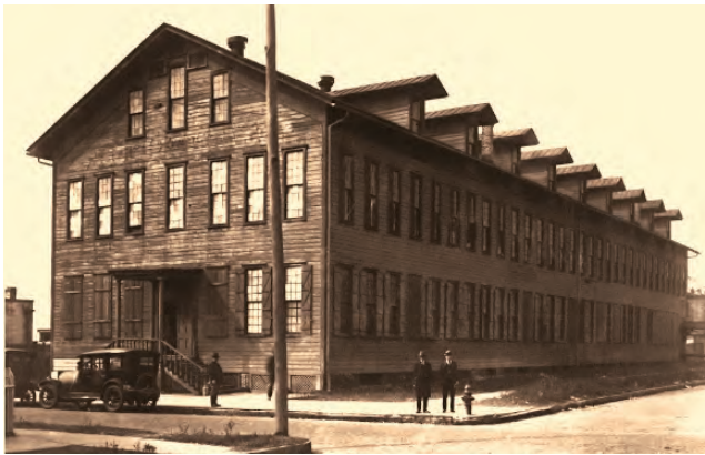
The Ybor Oliva project will add tall, narrow windows and new siding to restore historic character to the former cigar factory (shown above).