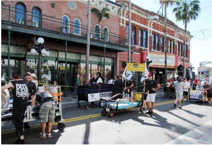
The Big Monsters Bed Race is coming back to Ybor City on Saturday, Oct. 25! During this Fantasma Fest event, five-person teams race wheeled beds down 7th Avenue from 15th Street to 17th Street. See which team will beat 2013 champions Coyote Ugly Saloon in the second annual event.

Get ready for a ghoulish good time as Fantasma Fest kicks off a series of Halloween events organized by the Ybor Merchants Association on October 21.