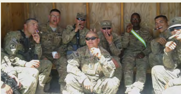
Members of the Detachment 63rd Ordnance Company enjoy cigars shipped from Ybor City soon after arriving at their post.

Cigar aficionados have sent a piece of home to American Armed Forces men and women. Cigars for Soldiers provides overseas military members with a care packages containing three cigars, a humidifier pack for freshness and a program insert.