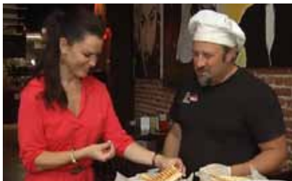
Learn to cook the signature dishes of Acropolis Greek Taverna and Stone Soup Company.