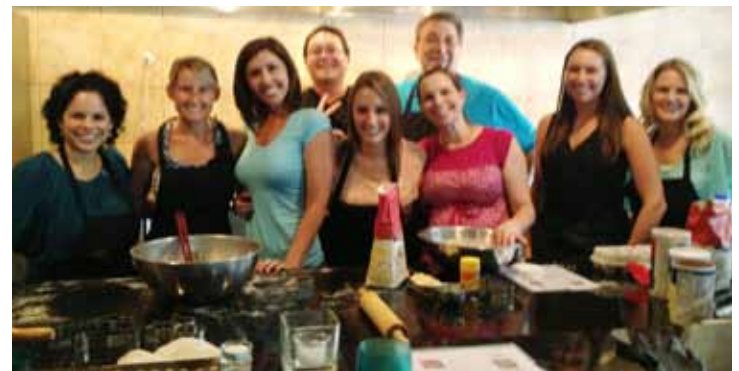
Employees of Kforce, a professional staffing and solutions firm headquartered near Ybor City, held a team building exercise at Stone Chef Catering and Events. As part of the session, the employees made dog treats for Tampa Police Department's K-9 officers.