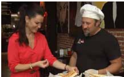
Learn to cook the signature dishes of Acropolis Greek Taverna and Stone Soup Company.