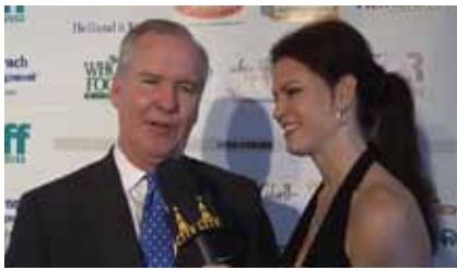
Walk the red carpet of the Gasparilla International Film Festival with Mayor Buckhorn.

Watch episodes of "Ybor Flavors" on Bright House channel 615 or Verizon channel 15 or online at YborCityOnline.com .